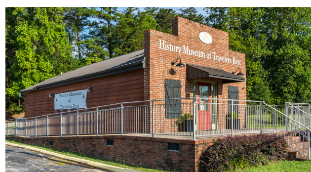
Travelers Rest History Museum