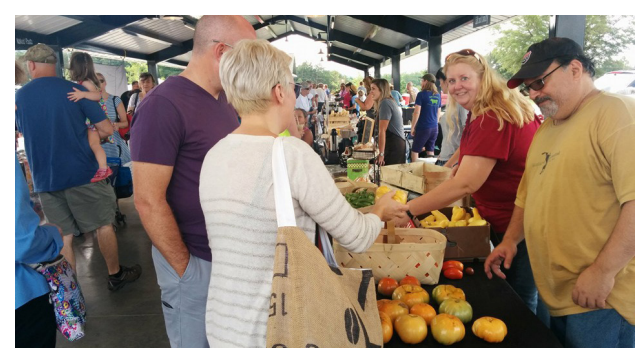
Travelers Rest Farmers Market